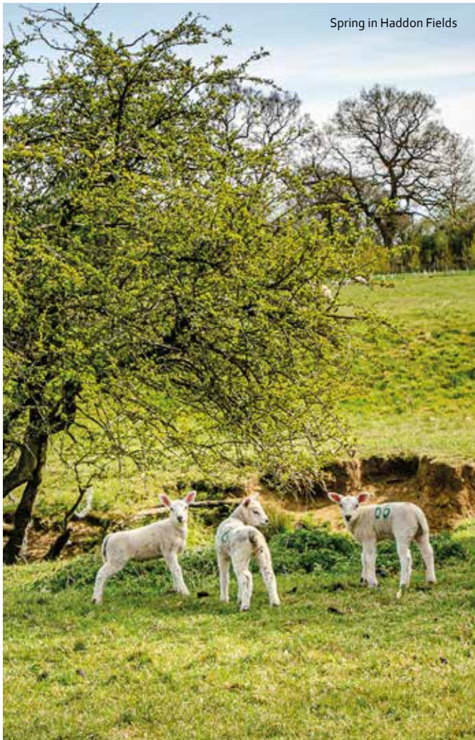
Spring in Haddon Fields