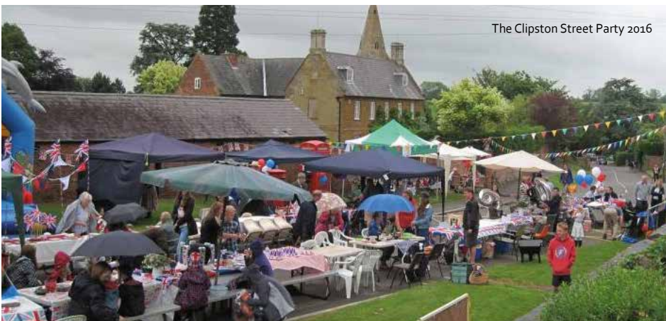
The Clipston Street Party 2016

For information on what's going on and ideas to help plan your own celebrations, please visit www.clipston.org and to view more photos of the 2016 street party go to https://www.clipston.org/2016-clipston-street-party