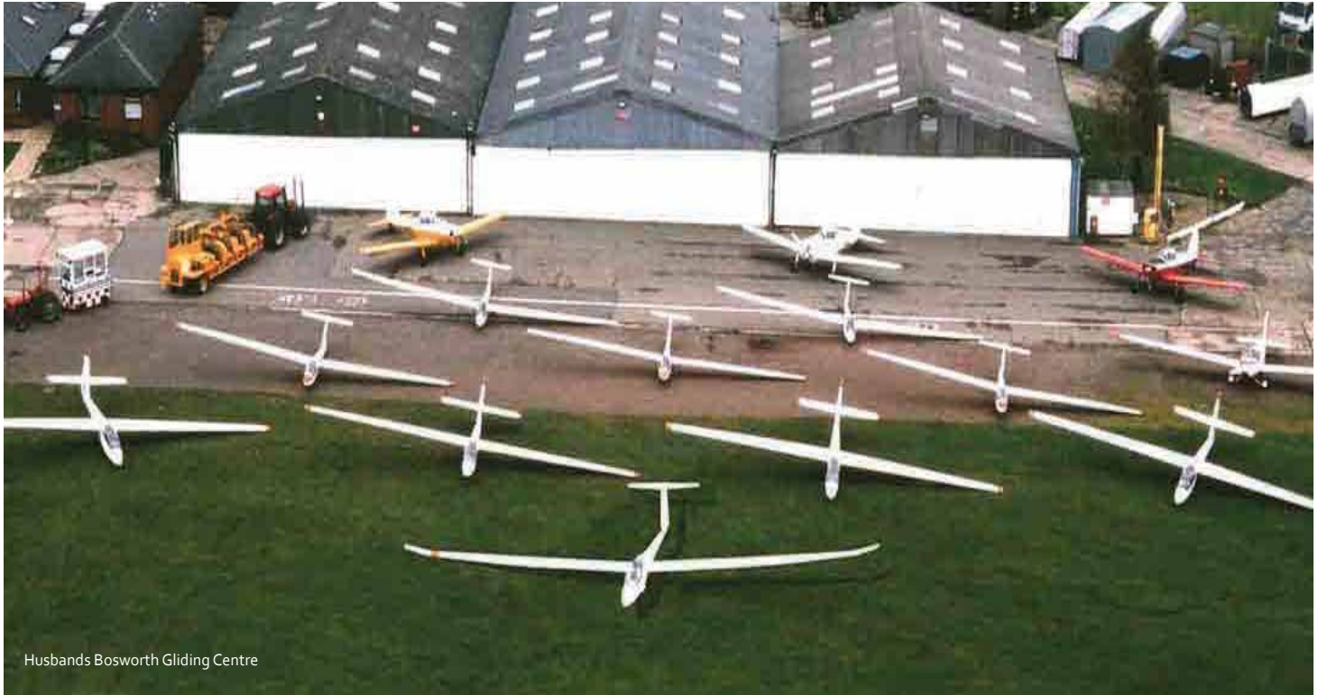
Husbands Bosworth Gliding Centre