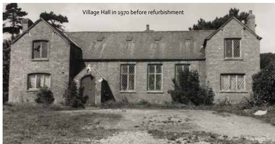
Village Hall in 1970 before refurbishment