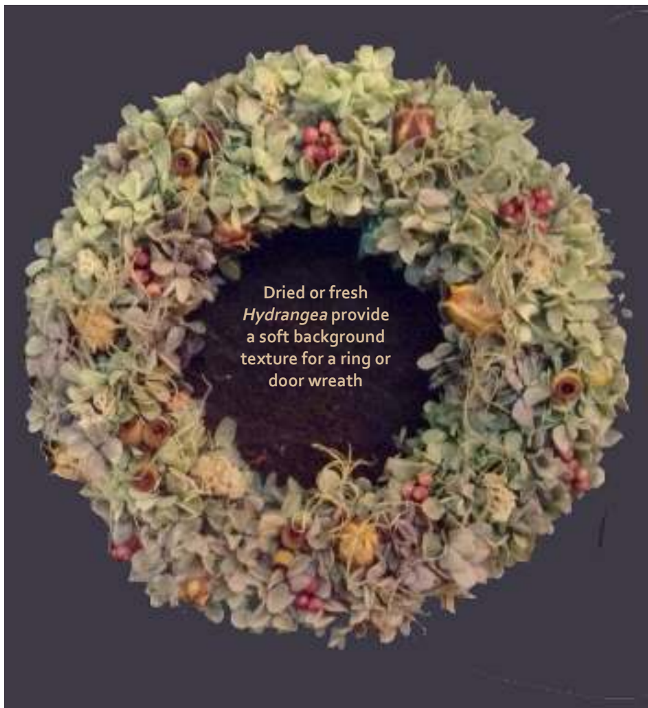
Dried or fresh Hydrangea provide a soft background texture for a ring or door wreath

Have some fun with Hydrangeas and if you haven't got any in your garden ask around, someone will have some. Perhaps we will see lots of Christmas wreaths on doors made from Hydrangea or perhaps it's too early to mention the "C" word?!