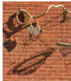
Linda’s hazel support and Shadow Wall

Easter has always been a time when we get together with club and church members to prepare the church for the special celebration services. It was a personal sadness to me not to be able to do it this year, as I have rarely missed being part of the team filling the church with spring flowers and light. It was such a pleasure for one of our members to make a small arrangement from garden flowers seen during the virtual Easter Day service, beamed from the rectory to all seven villages in the benefice.