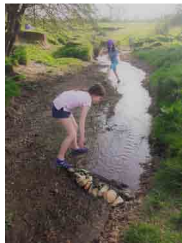
Clipston children enjoying the stream at Haddon Fields

As you will have seen, no sheep have been grazing since January. This 'rest period' is