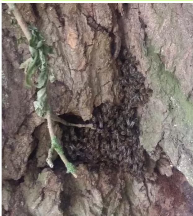
Bees in Tree

Recently sighted; Bees in a tree (see picture) perhaps the tree is hollow and there are thousands more inside?