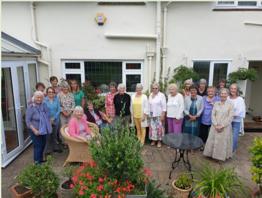
WI Garden Party