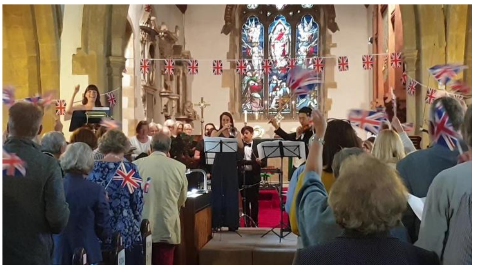
Audience Flag Waving in 'Rule Britannia'