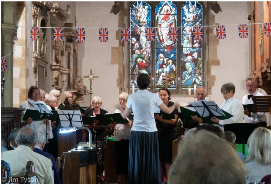
The Benefice Choir