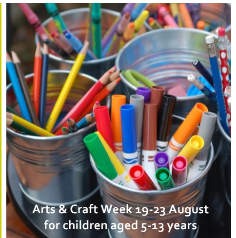
Arts & Craft Week 19-23 August for children aged 5-13 years

For children aged 5-13. Sessions will run each day at the village hall. Expect a different art/craft each day including painting, collage, hand sewing, clay work and much more! Expert tuition from Leicestershire Craft Centre and Clipston's own talented artists and craft workers. 24 places per day are available. Book a single session for £10 (£5 discount for siblings attending the same session) or the whole week for £40. Price includes all tuition, materials, drinks and a snack.