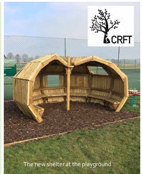
The new shelter at the playground