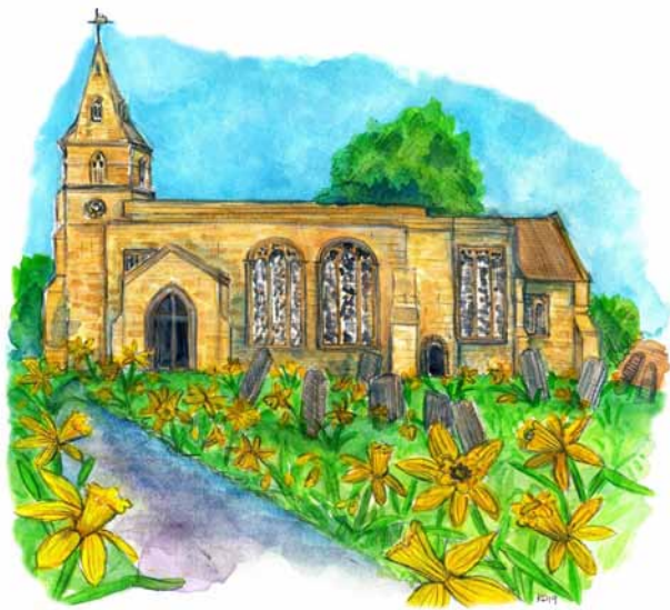
All Saints Church, Clipston