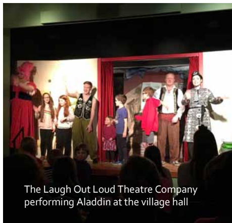
The Laugh Out Loud Theatre Company performing Aladdin at the village hall

Once again, the village hall came alive to the merriment of the traditional pantomime in January, which is now becoming an annual fixture and firm favourite on the Clipston calendar. This year, the Laugh Out Loud Theatre Company treated us to the delights and hilarity of Aladdin, with the usual ridiculous antics and audience participation. The event was well attended and raised money for the Tennis Club and Stepping Stones, who provided the welcome refreshments. Thanks to everybody who was involved in the organisation and providing the refreshments. We all had a lovely time!