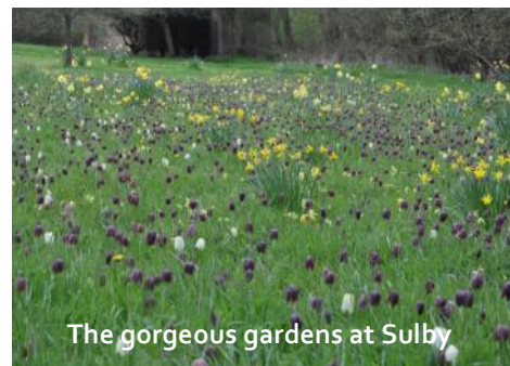
The gorgeous gardens at Sulby

Sulby Gardens will be opening its gates for the first time this year under the National Gardens Scheme on Thursday 27 April from 2pm to 5pm. Featured will be the amazing meadow of Snakeshead Fritillaries and Cowslips, with hopefully, Bluebells in the spinney as well. As usual, tea and homemade cakes will be available, as well as Sulby Gardens Apple Juice and home grown plants while stocks last. Displayed in the Conservatory Tea Room will be copies of the fascinating booklet, the Story of Sulby Gardens, featuring also chapters on Sulby Hall, the Icehouse, the Husbands Bosworth Wartime Aerodrome and the Sulby Polish Resettlement Camp. Entry to garden £4 per head Tea and cake £3 per head Stout footwear recommended. Sulby is between Sibbertoft and Welford, follow the yellow NGS signs from Welford Road, opposite the Gliding Club (NN6 6EZ)