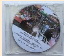
Queen's 90th Birthday Celebrations CD