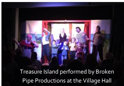
Treasure Island performed by Broken Pipe Productions at the Village Hall

Once again, the Tennis Club and Stepping Stones organised a fantastic event when Broken Pipe Productions brought the panto Treasure Island to Clipston Village Hall in January. Jokes, hilarious costumes and silly songs were the order of the day, and Clipston residents, old and young, all thoroughly enjoyed it! Thanks to all who helped make it happen. Bring on next year!