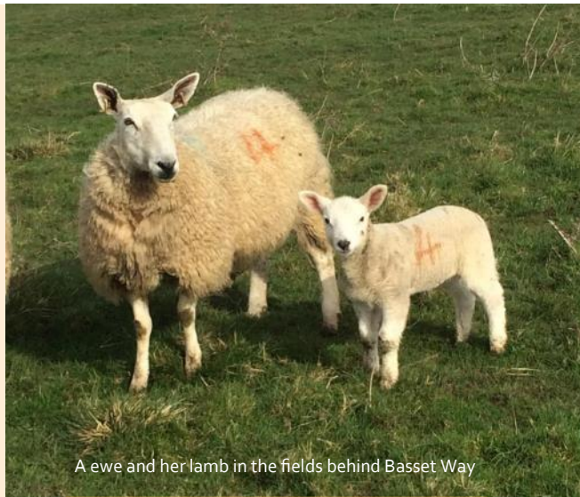
A ewe and her lamb in the fields behind Basset Way

Colin lambs earlier than many farmers to catch the early trade at market and by the beginning of February the ewes are brought into the barns where they spend their final days of their five-month pregnancy. Once lambing starts each ewe is placed in an individual pen to ensure she bonds with her lambs and they feed well from her. Colin tells me intervention in the birth is only occasionally required, generally if the lamb is breech. As soon after birth as possible the lambs' navels are sprayed with iodine to prevent any infection and within 24 hrs, they are painted with a number that matches that of their mothers.