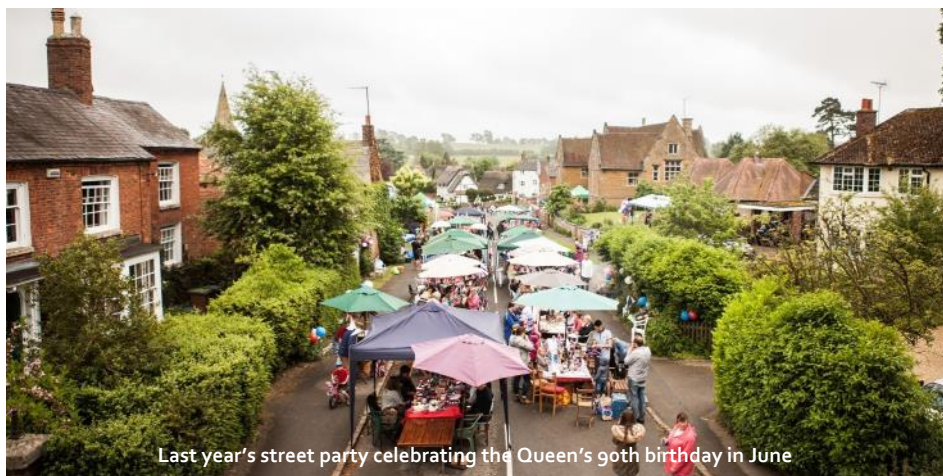
Last year's street party celebrating the Queen's 90th birthday in June