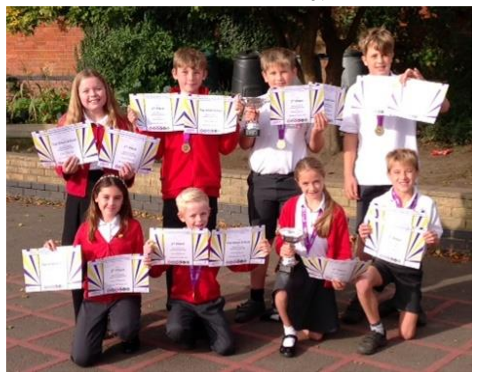
Clipston School children proudly showing the rewards for their achievements