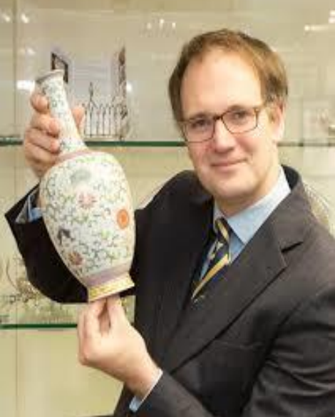
Auctioneer and T.V. Personality