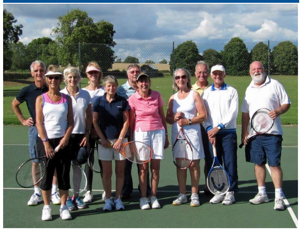
Clipston Tennis Club Members 2016