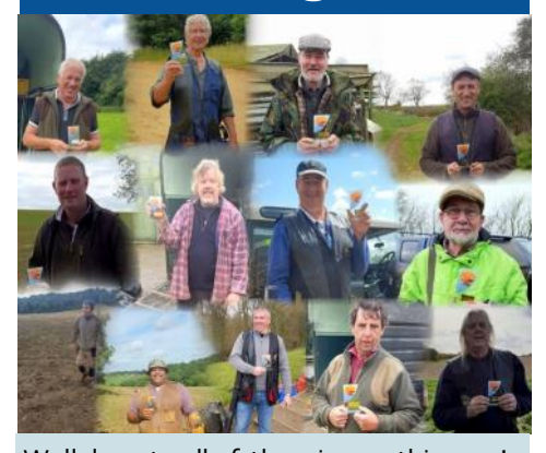
Well done to all of the winners this year!

Clipston Shooting Club usually meet on the last Sunday of the month around 10am after breakfast in the pub, and finish about 11.30—just in time to get to the Bull's Head for further refreshment!