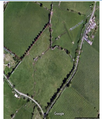
Great Hill & Little Hill