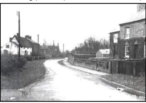
Kelmarsh Rd; Weskers Cottage on the right, was bombed in 1942

scathed from the bombing raids but in 1942 a HE bomb was dropped in the pond at the rear of Weskers Cottage (now the end of Weskers Close) which caused extensive damage to the cottage and surrounding area. We were living at the white house at 17 Kelmarsh Road at the time and windows were smashed, the lath and plaster ceilings collapsed and the chimneys were blown down. Amazingly nobody was hurt as the family