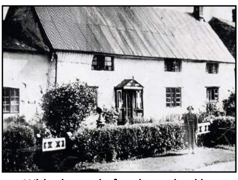
White house before it received its camouflage.

My father received a letter one day telling us to change the colour of our white house as by moonlight it could be spotted and used as a navigational aid for enemy aircraft. We collected bucketfuls of cow and sheep droppings from the fields and mixed them with water in an