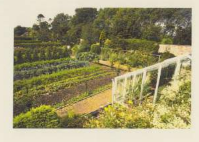
a small comer of Northamptonshir

All profits from the open gardens and the Sulby Gardens booklet will go to charity. £4 entry, children free.