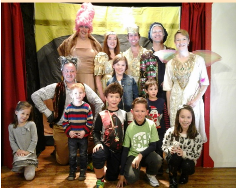
Photo: The cast of Red Riding Hood joined by youngsters from the audience