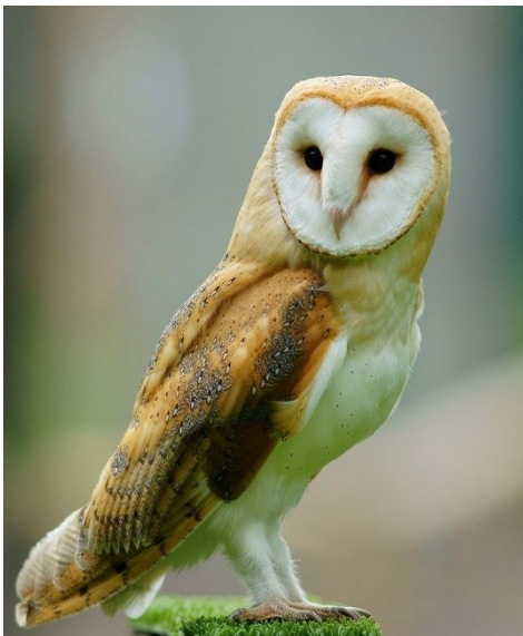
A Barn Owl at British Wildlife Centre, Surrey, England.

Owl Class at Clipston school have been busy making pictures of brightly coloured owls.