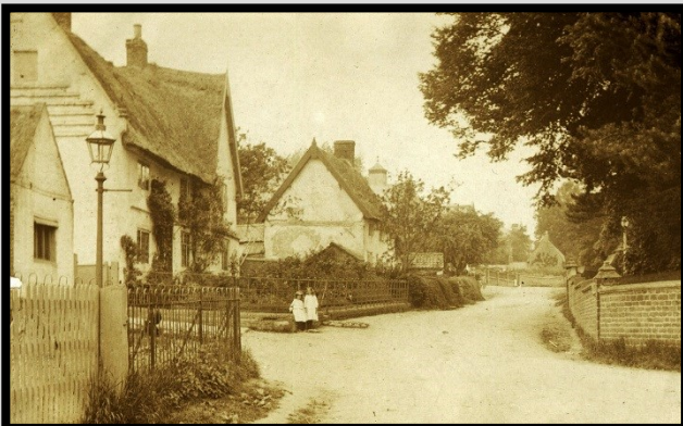
Lighting in the village

Other Clipston news, researched to the end of September 1915, included a report of the Annual Parish Meeting. An item relating to the "voluntary lighting of the village" stated that the proceeds of a Whist Drive were for this purpose and that where necessary the lamps would be repaired. (These were oil lamps, as electricity did not come to the village until about 1927.)