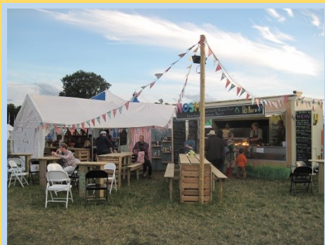
'Nosh' Community Stand 2015

As part of the set-up we needed to build or purchase various items of outdoor furniture and catering equipment. These include: