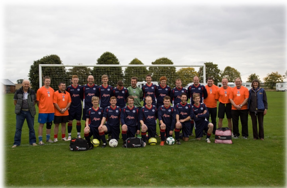
Clipston Football Club