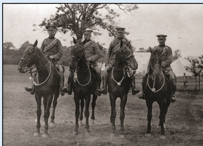
Celebrations were held to commemorate the coronation of King George V.