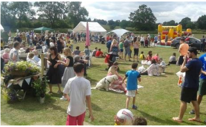
Clipston Festival 2015

Well the weather does help! ... But the real success of this year's festival came from the huge involvement of many people from the village – it created a village party feeling and this has led to us raising £4863.43